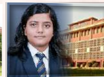
Gargi DU, Miranda House, New Delhi