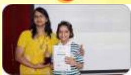
Annual Prize Distribution (KG's, IV & V) 20th April