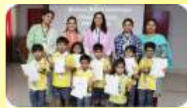
Annual Prize Distribution (Class III to V) 18th April