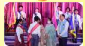
Protsahan 2022 23rd April

Session began with new energy and fresh new vibes, time for new hopes and renewed dreams. Activities give pathway to the kids to explore new interests. Keeping the same thought in mind, Sunbeam always stand tall when it comes to academics or co-curriculars. Because each has its own importance. The activities are planned in such a way that engages the kids & gives them scope for exploration. The April month witnessed activities in full swing because no matter it's online or offline, we pave our way towards excellence.