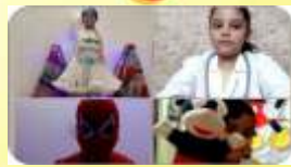
Monthly Activity Presentations by Class- 2 11th April