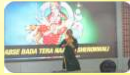
Special Assembly on Ramdan & Ramnavami 9th April