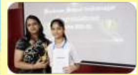
Annual Prize Distribution (Class VI to VIII) 19th April