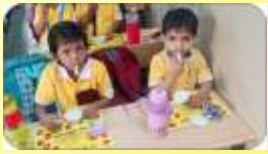
Ice Cream Eating Activity 6th April