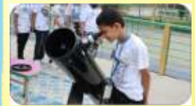
Stargazing Activity 12th & 13th April