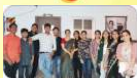
Alumini Surprise Meet 20th April