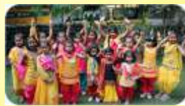
Baisakhi Celebration 13th April