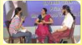
Talk time with Principal ING 11th April