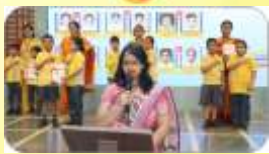
Monitor's Investiture Ceremony 13th April