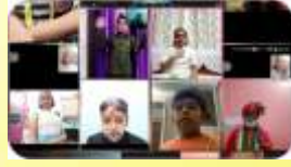
Monthly Activity Presentations by class 3 9th April