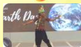
Earth Day Celebration 22nd April