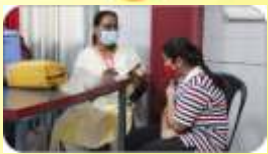
Vaccination Camp (12-14yrs) 11th April