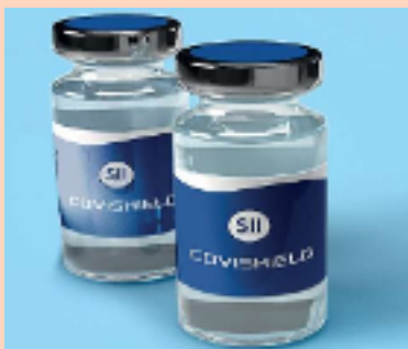
~ Nirmitt Chaurasia (IX-C)