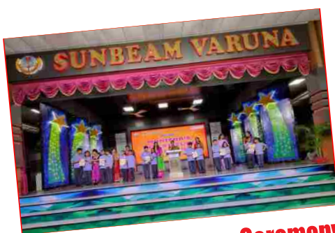
Monitors' Investiture Ceremony