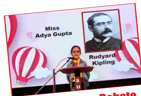
Hot Air Balloon Debate