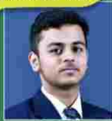
Grade - X