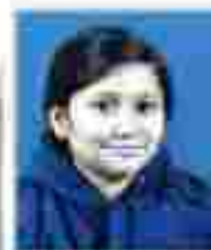
AAKHA 5 th Rank

Outshining 2,035 entries from 189 schools across 6 countries.