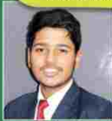
Grade - IX