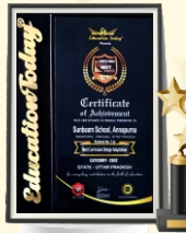
Best Curriculum Design Adaptation