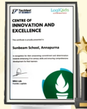
Centre of Innovation and Excellence