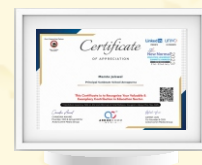
Exemplary Contribution in Education Sector