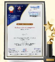
Most Promising School for Academic Excellence 2023