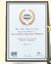
Progressive School Chain of the Year - National