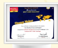
Proud Winner of Design for Change 2023