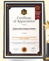
Best in U.P. for Futuristic Education