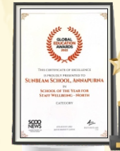
School of the Year for Staff Wellbeing